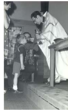
From the archives . . . A photo from our first Divine Liturgy in Richmond, VA (Pace Chapel)